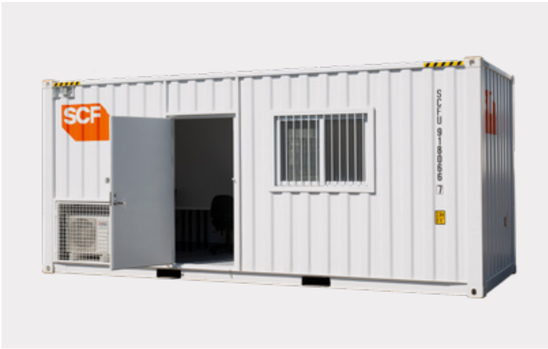
Top: The 20ft First Aid room can be stacked like all other SCF Site Sheds.