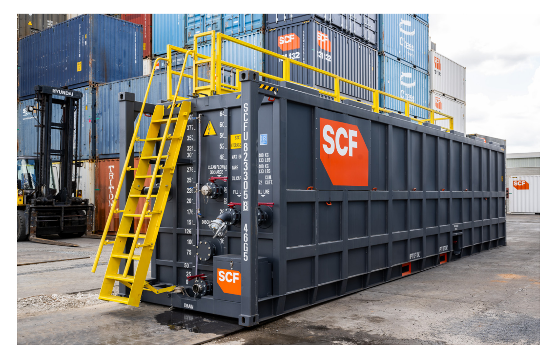
Middle Left: AS1657 compliant stair and hand rail system

Top: AS1657 compliant stair and hand rail system